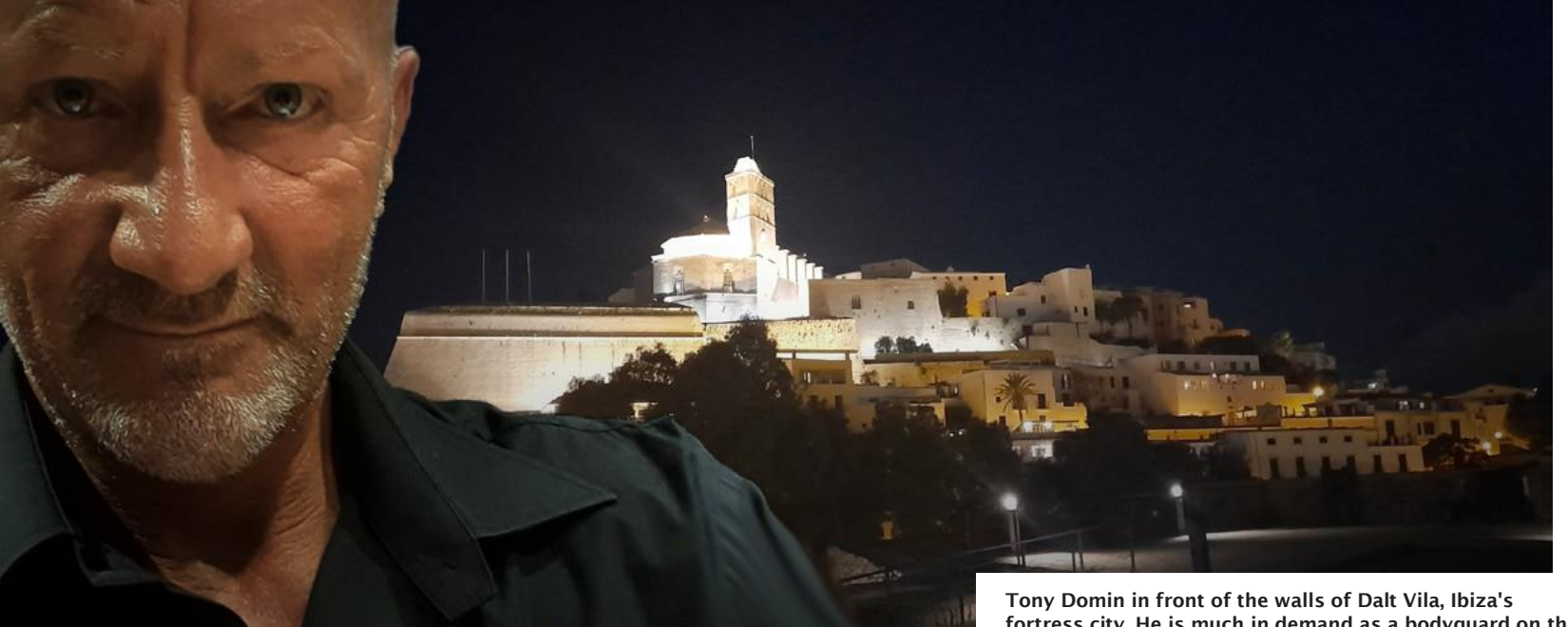
fortress city. He is much in demand as a bodyguard on the island with its many rich and beautiful people